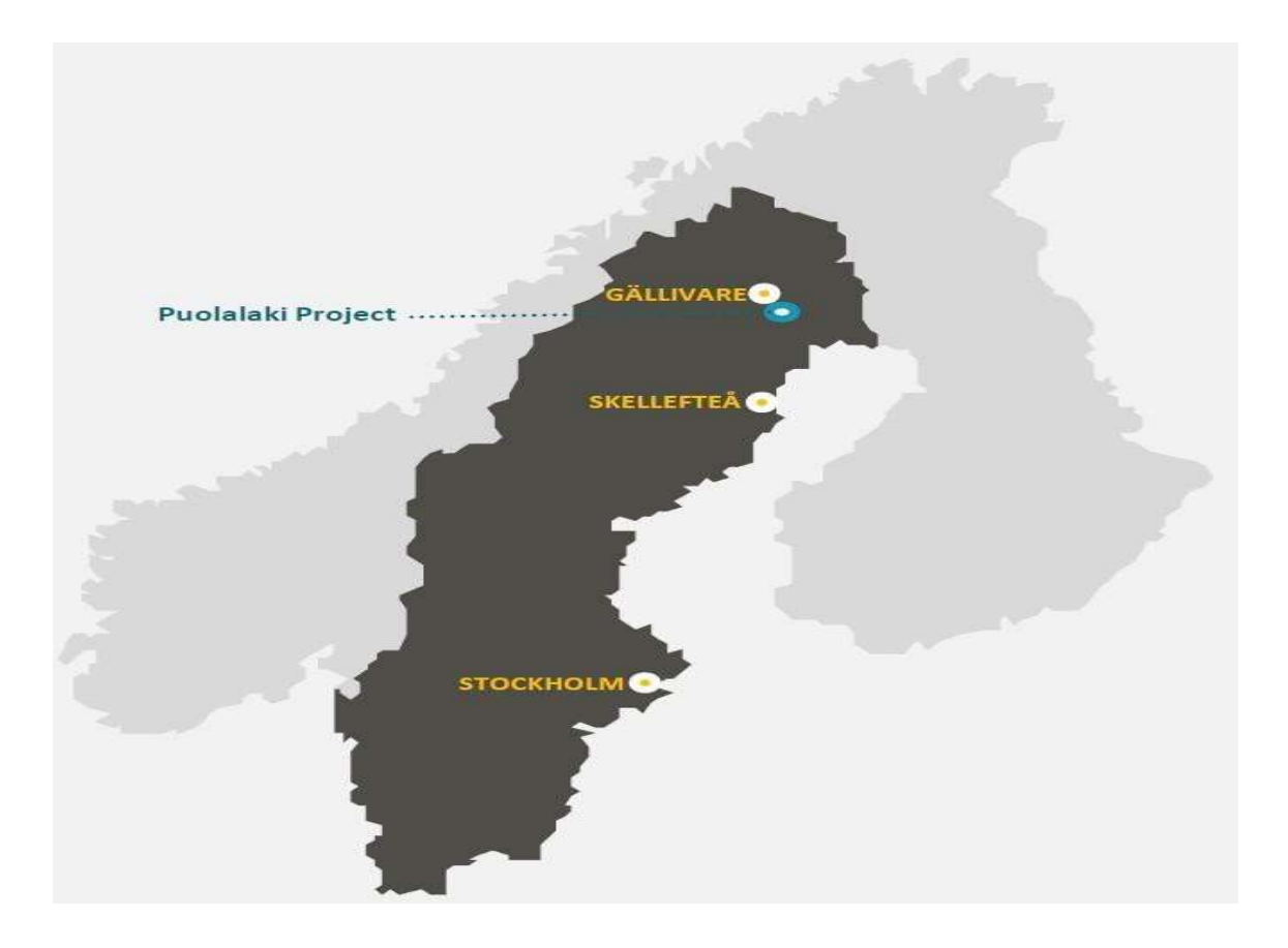
Figure 1. Location of the Puolalaki Ni-Cu-Co project in Northern Sweden