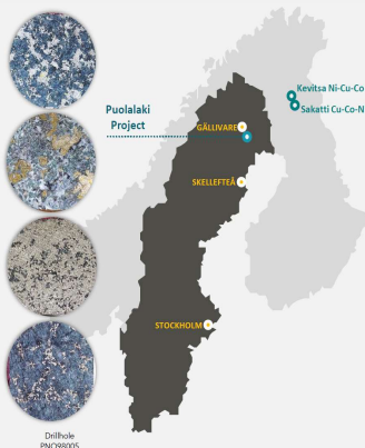
Puolalaki Project location, Sweden

402,500,000 Unquoted options exercisable at $0.003 on or before 30 June 2027